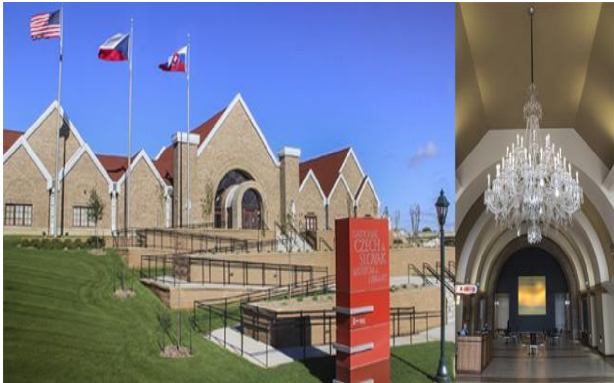
The National Czech & Slovak Museum and Library was one of the fun stops for the 47 ISUWC members who traveled to Cedar Rapids

ISUWC members enjoyed a great day in Cedar Rapids on the Past Presidents' Fall Bus Trip visiting the National Czech & Slovak Museum & Library, having lunch at Bata's, a guided tour of Cedar Rapids, and a glimpse of the Iowa Scenic Byway with a stop at Fire-side Winery near Marengo.