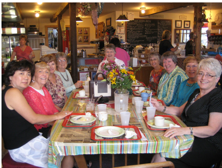
On the road for another Tearoom Adventure!