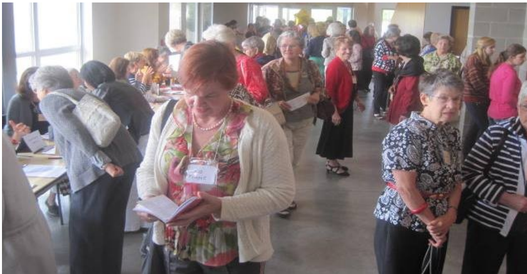
Excited members and members-to-be signing up for interest groups and enjoying Fall Opener