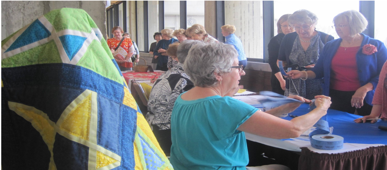
Raffle sales for the Block Builders' quilt are brisk as members hope they are purchasing the lucky ticket!