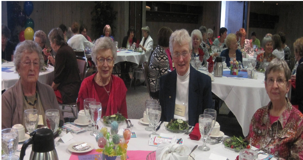
These Twenty-Five Year ISUWC members were honored at the Spring Luncheon