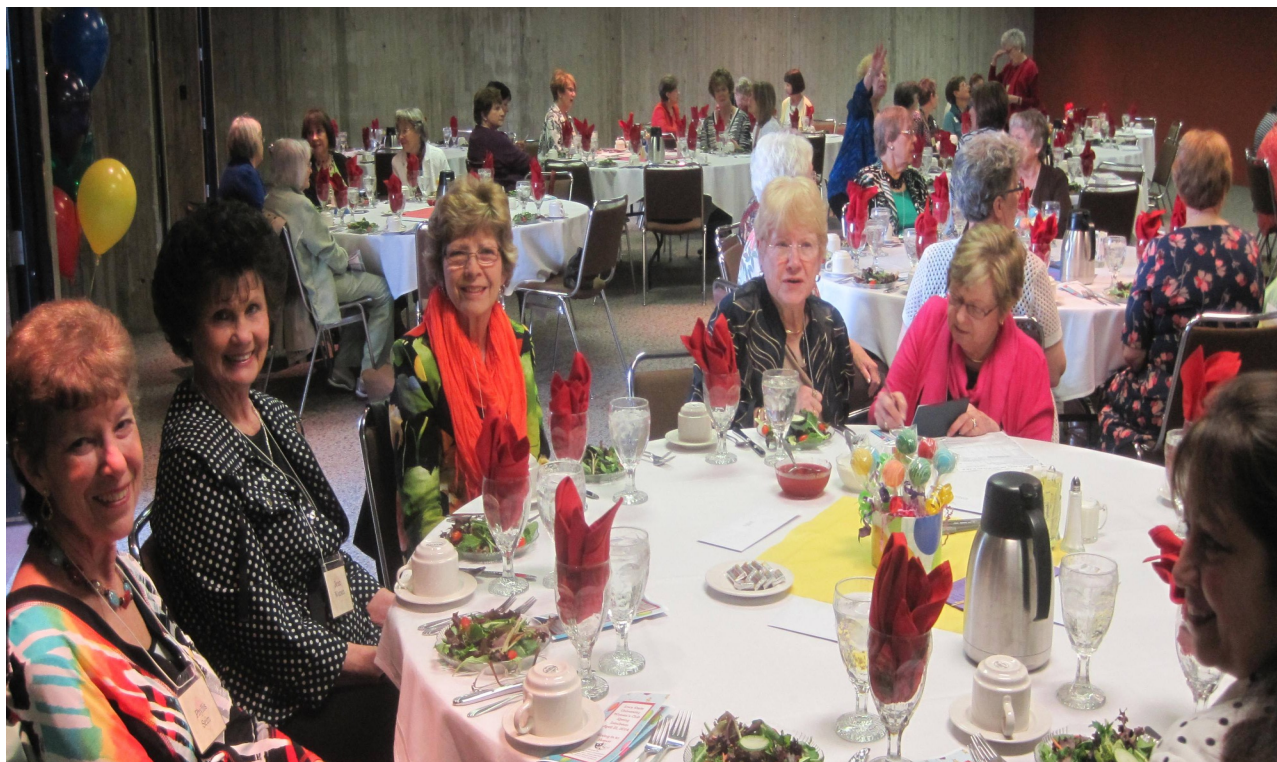
2013-2014 Spring Luncheon fun