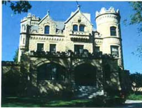
Joslyn Castle, Omaha

Sponsored by the ISUWC Past Presidents' Club