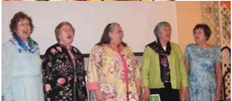
The Belles performing