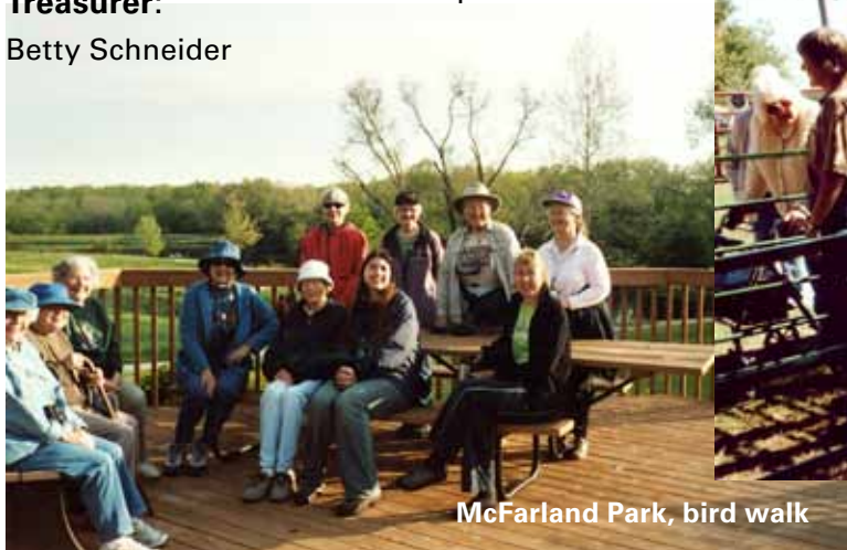
McFarland Park, bird walk