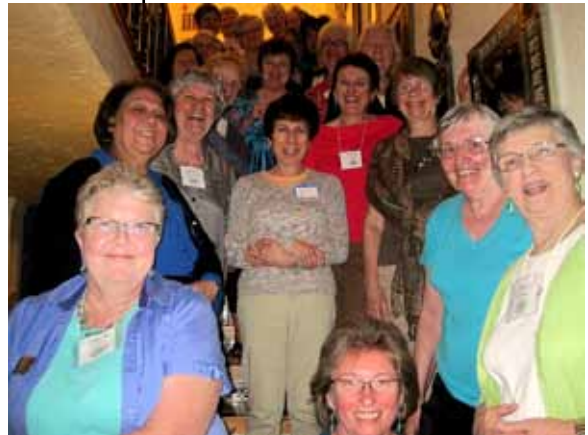
Visiting the Dubuque Courthouse