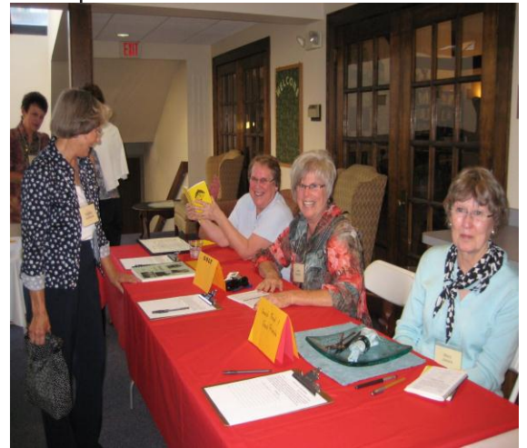
Division chairs ready to sign up new members