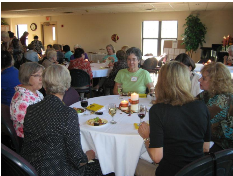
Food and fellowship at the Fall Opener