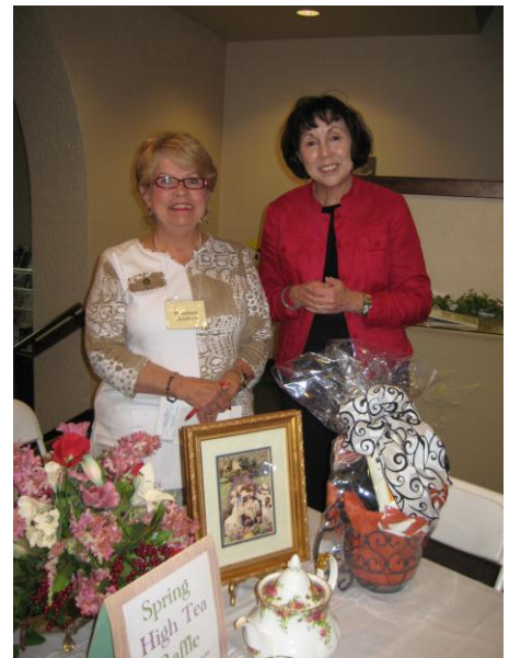
Raffle to promote the Spring Tea