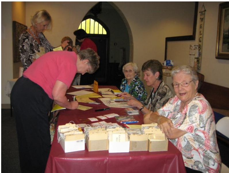
Guests registering for the Fall Opener