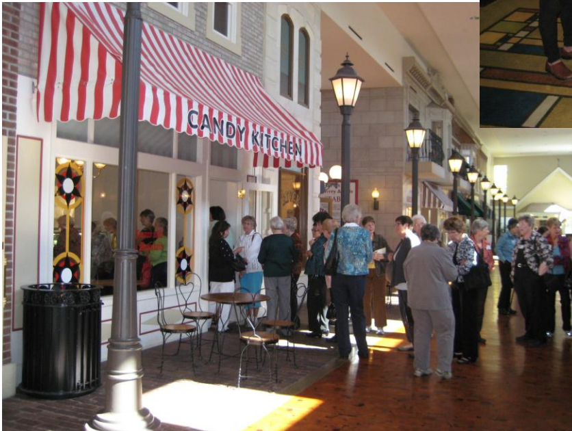
Enjoying ice cream at Music Man Square