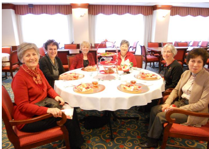
Gourmet II held a Friendship Tea on December 1 at the Green Hills dining room.

Gourmet II members enjoy excellent food and fellowship when they meet in the homes of members on the first Thursday of the month at 12:00 noon with lunch served at 12:30 p.m. (except January, no meeting). The monthly host committee plans, prepares, and serves the luncheon and distributes the recipes used. There is a fee of $8.00 for each meal. Membership is limited.