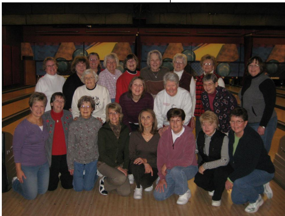
The Bowling Division taken one morning before bowling.

The Bowling Division's service project included collecting money for the ISUWC scholarship program, milk money for "Food at First", Bethesda Food Pantry, and MICA.