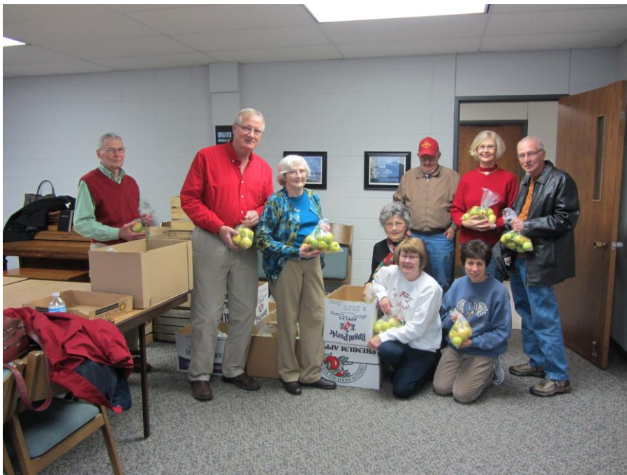
On December 14, 2011, Couples Club II bagged apples at Bethesda Food Pantry for the club's Community Service Project.