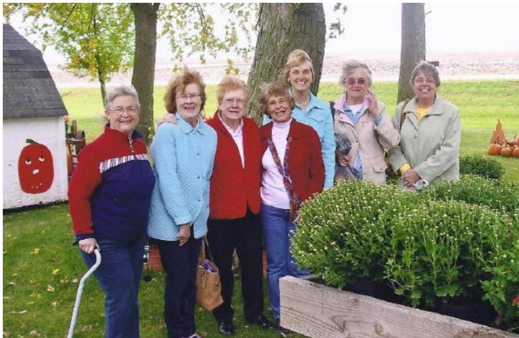
September 26 day trip to "Barn Quilts of Hamilton County".

Stitchery meets on the first Monday of each month from 1-4 p.m., October through May, and at other times as indicated for special projects. The focus is on traditional stitchery techniques with modern applications. Division dues are $5 per year. Unless noted otherwise, meetings are held at the Greater Iowa Credit Union, 2623 Northridge Pkwy. Membership is open and guests are welcome.