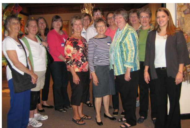
Tour of Brunnier Art Museum on October 7

All new members of the ISUWC are invited to join the Newcomers Division. Whether just moving into the area or simply new to the Club, Newcomers provides an opportunity to meet other new members and have some fun at informal social events where participants learn about the club's programs and events.