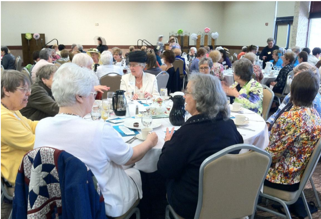
ISUWC members enjoy the Spring Tea on April 16, 2012, in the Garden Room of The Gateway Hotel and Conference Center.