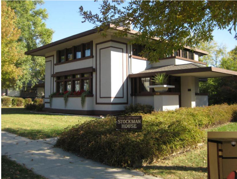
Everyone toured the Frank Lloyd Wright Stockman House.