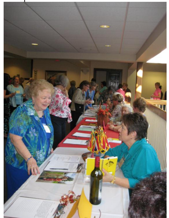
Learning about the 22 different divisions