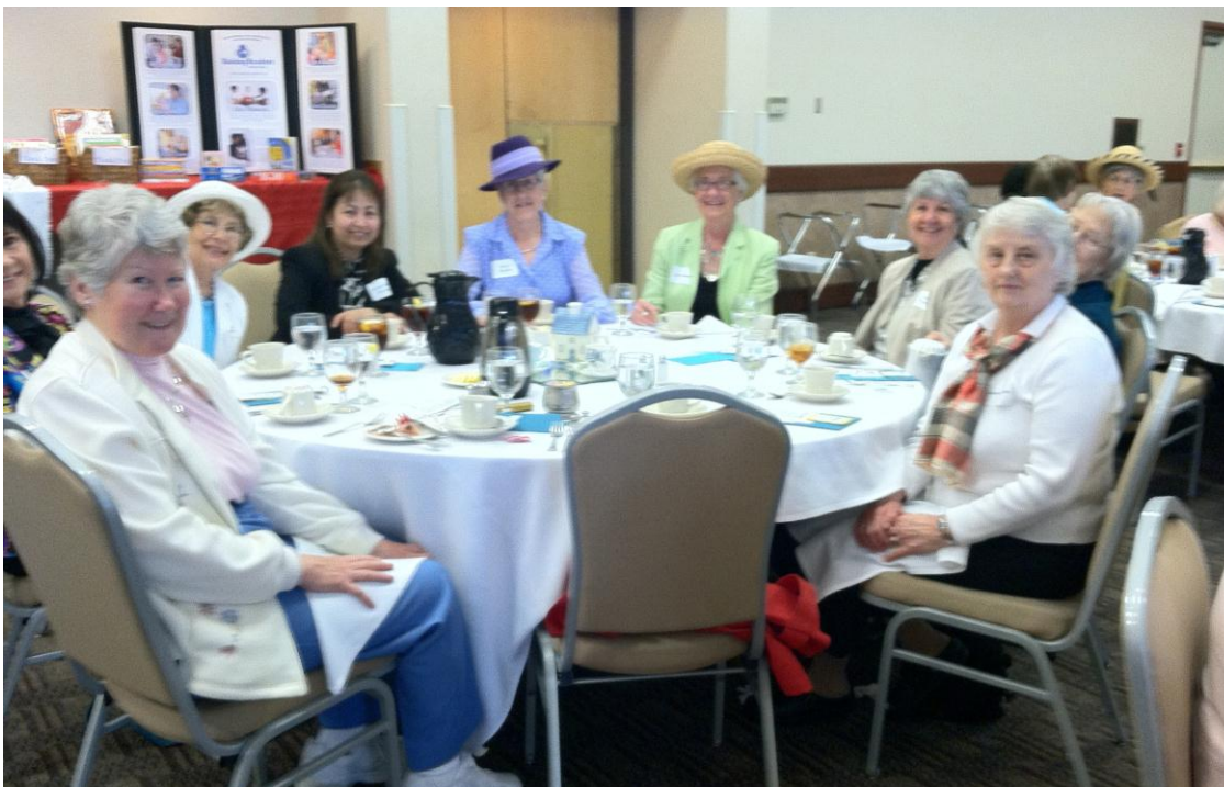
Members of the Iowa State University Women's Club enjoy the Spring Tea in the Garden Room at The Gateway Hotel and Conference Center.