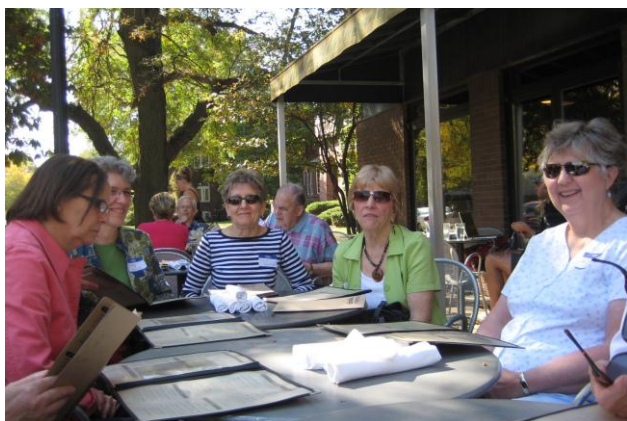
Lunch at Stomping Grounds after tour of Brunnier Art Museum on October 7