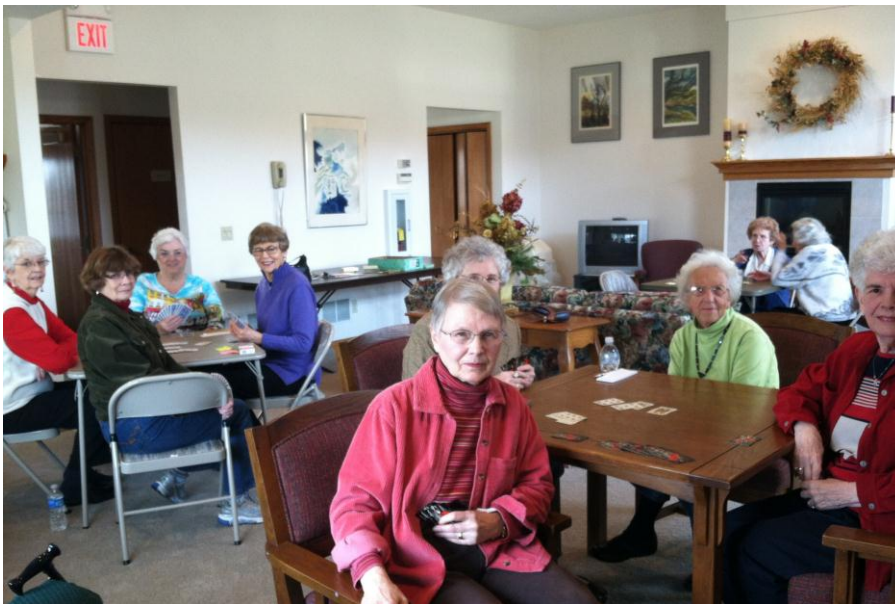
Bridge Division January Meeting