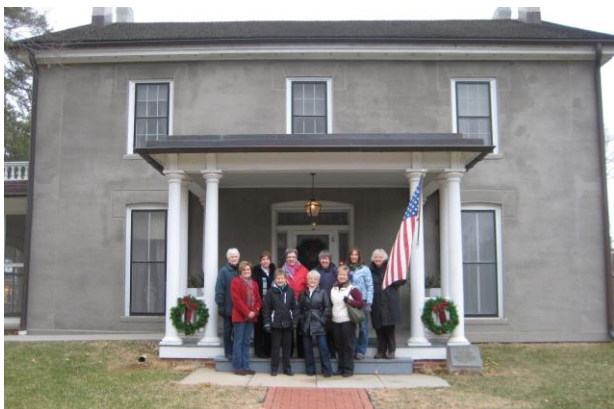
Newcomers December 12 tour of the ISU Farmhouse