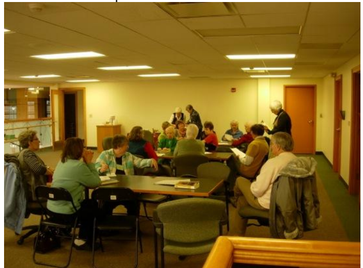
Book Club meeting at the Greater Iowa Credit Union on November 21, 2011