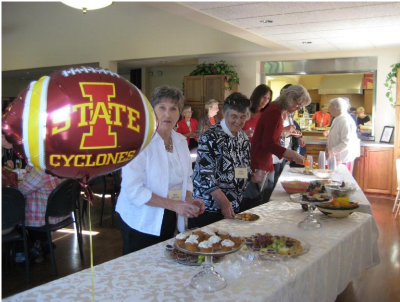
Refreshments at the Fall Opener