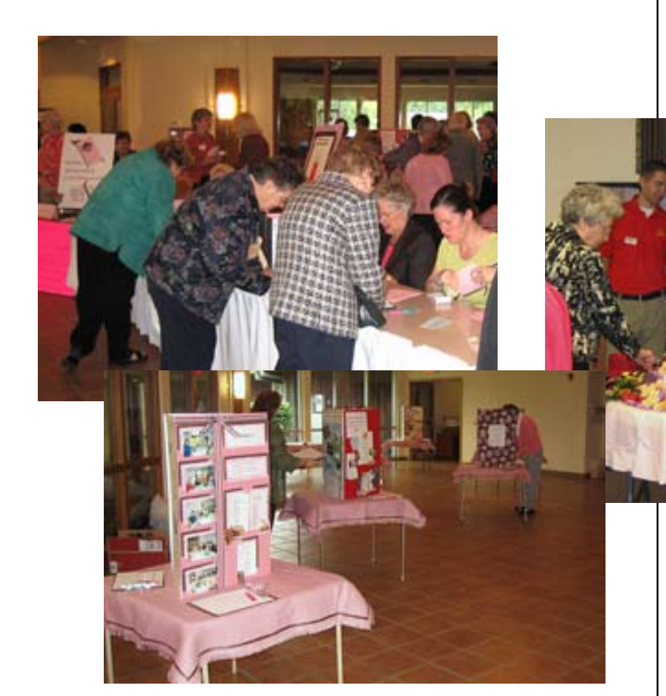
Divisions displayed photos and information concerning their activities.

What an inviting treat, a chocolate fountain with fresh fruit!