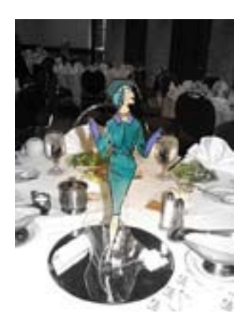
Table decorations created by Jo Walker-Meyers.