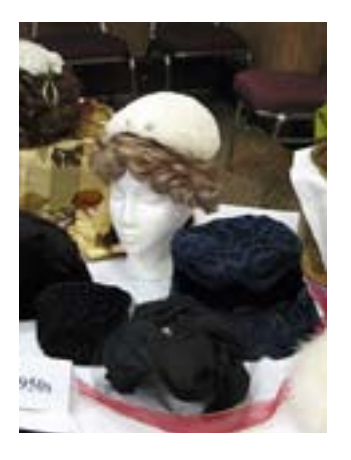
Hats, dresses and other fashion items from the last century were displayed or women during the luncheon.