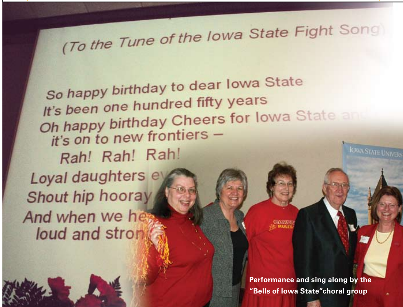
Performance and sing along by the "Bells of Iowa State" choral group